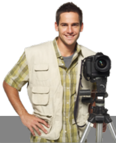
WAYS TO INCREASE INCOME