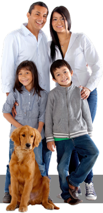
WAYS TO DECREASE SPENDING