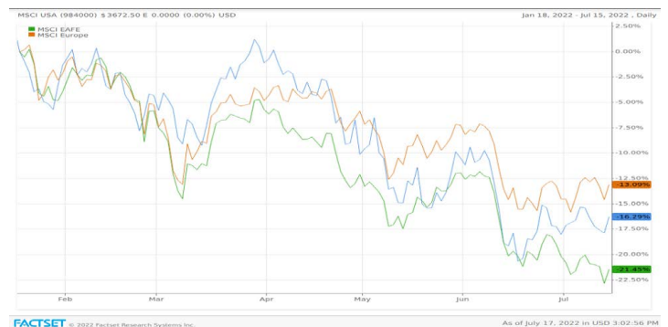
Exhibit 3: Performance by Geography