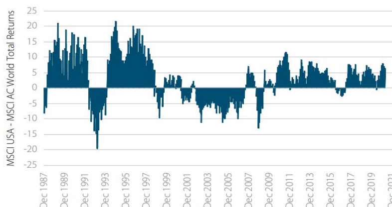
Exhibit 1: US Minus Global Stocks: Monthly Rolling Annual Returns, 1987-2021

Source: https://www.artisanpartners.com/content/dam/documents/insights/vr/Insights-The-Case-for-Investing-Outside-the-US-vR.pdf