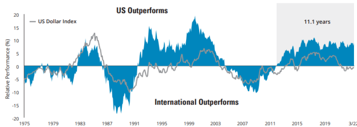
Exhibit 2: US Equity vs. International Equity: 5-Year Monthly Rolling Returns (1/31/2975-3/31/2022